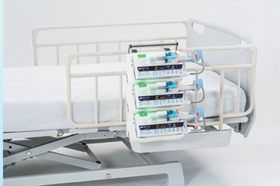
Hangable on bed side fence