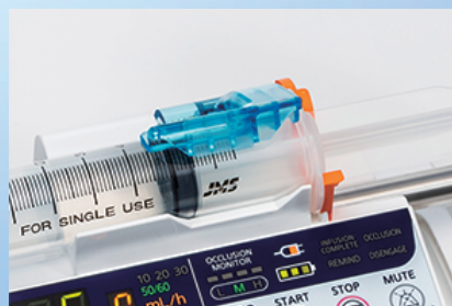
Transparent syringe clamp