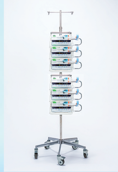
Dedicated IV stand for 2 Docking Stations