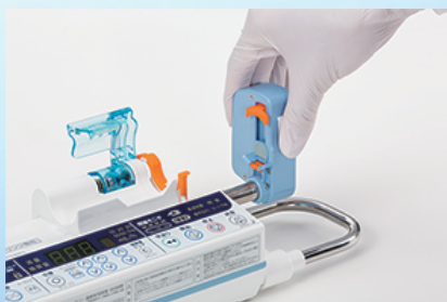
Easy to attach syringe