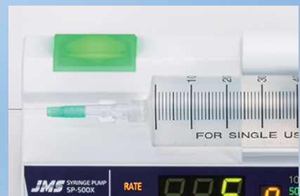
Intuitive main lamp