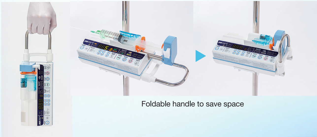
Foldable handle to save space

Compact body, weighting only 1.6kg, reduces the burden of carrying and the risk of the pump falling. Compared to the previous JMS Syringe Pump SP-500, the weight has been reduced by about 40% and the volume has been reduced by about 50%.